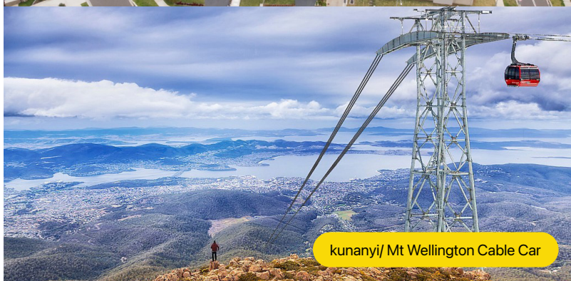
kunanyi/ Mt Wellington Cable Car