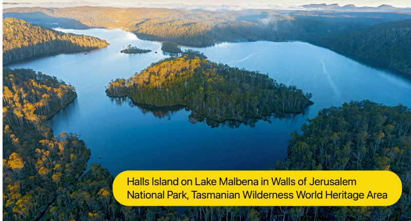
Halls Island on Lake Malbena in Walls of Jerusalem National Park, Tasmanian Wilderness World Heritage Area